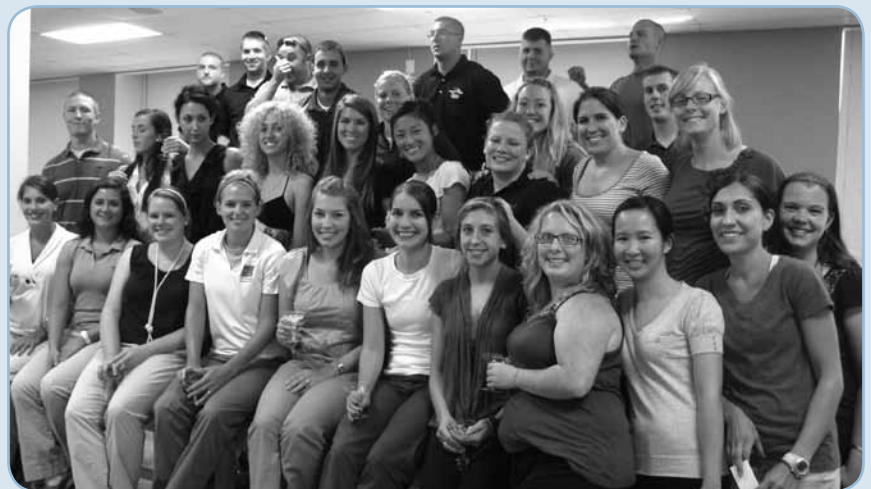
Class of 2012 last class on campus before departing for their internships.