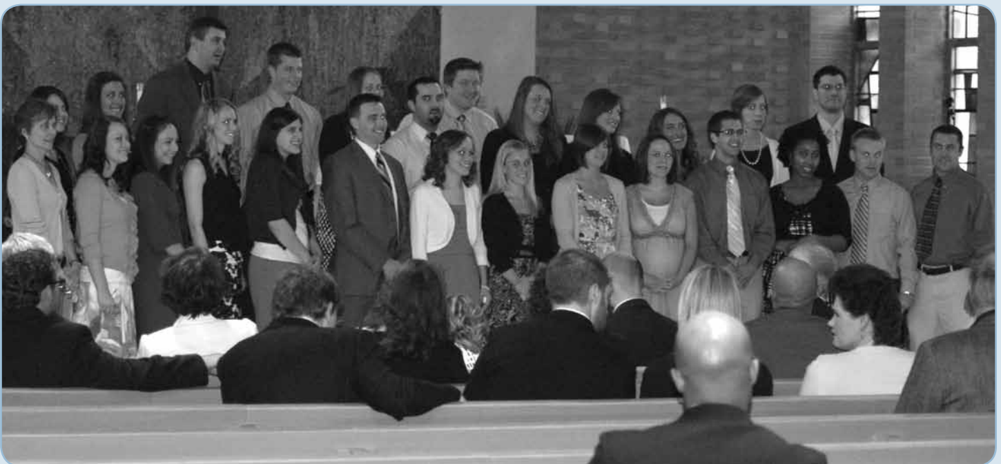
Class of 2011 Convocation Ceremony