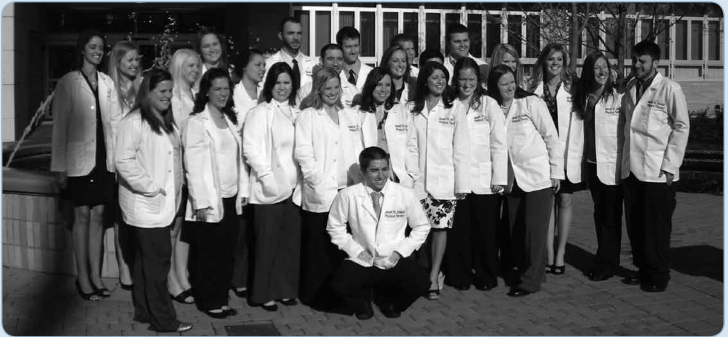
White coat ceremony for class of 2013.